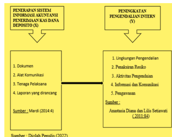
Figure 1 question items for each variable in the research framework

According to Sugiyono (2017:43), The research method is the method used in research activities. The research method used in this study is a quantitative descriptive method. Data collection techniques through observation, interviews, and questionnaires filled in by 22 employees of PT. BPR Kerta Raharja Banjaran Branch as the respondent. The items for the questionnaire questions for each variable can be seen in the following research framework image.